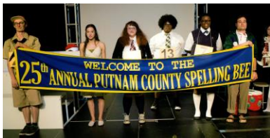
25 th Annual Putnam County Spelling Bee