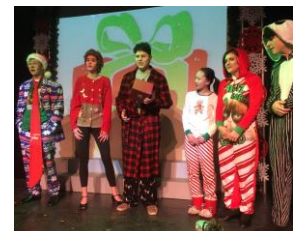
Sounds of the Season

Our 2018/19 Theatre Productions at ICS so far, have included 6 shows of The Greeks , and 3 of an original cabaret holiday musical, Sounds of the Season .