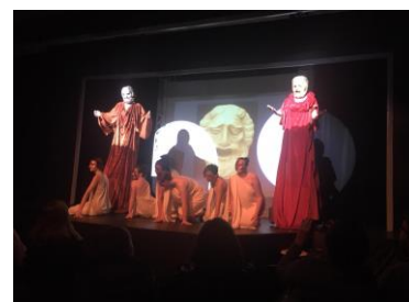
The Greeks: In the Beginning

Our Youth and the Arts (YATA) program partners Claude McNeal Productions with acclaimed charter schools, Herron High School and now Riverside High School (now known collectively as Indianapolis Classical Schools).