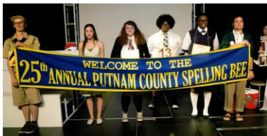
25 th Annual Putnam County Spelling Bee